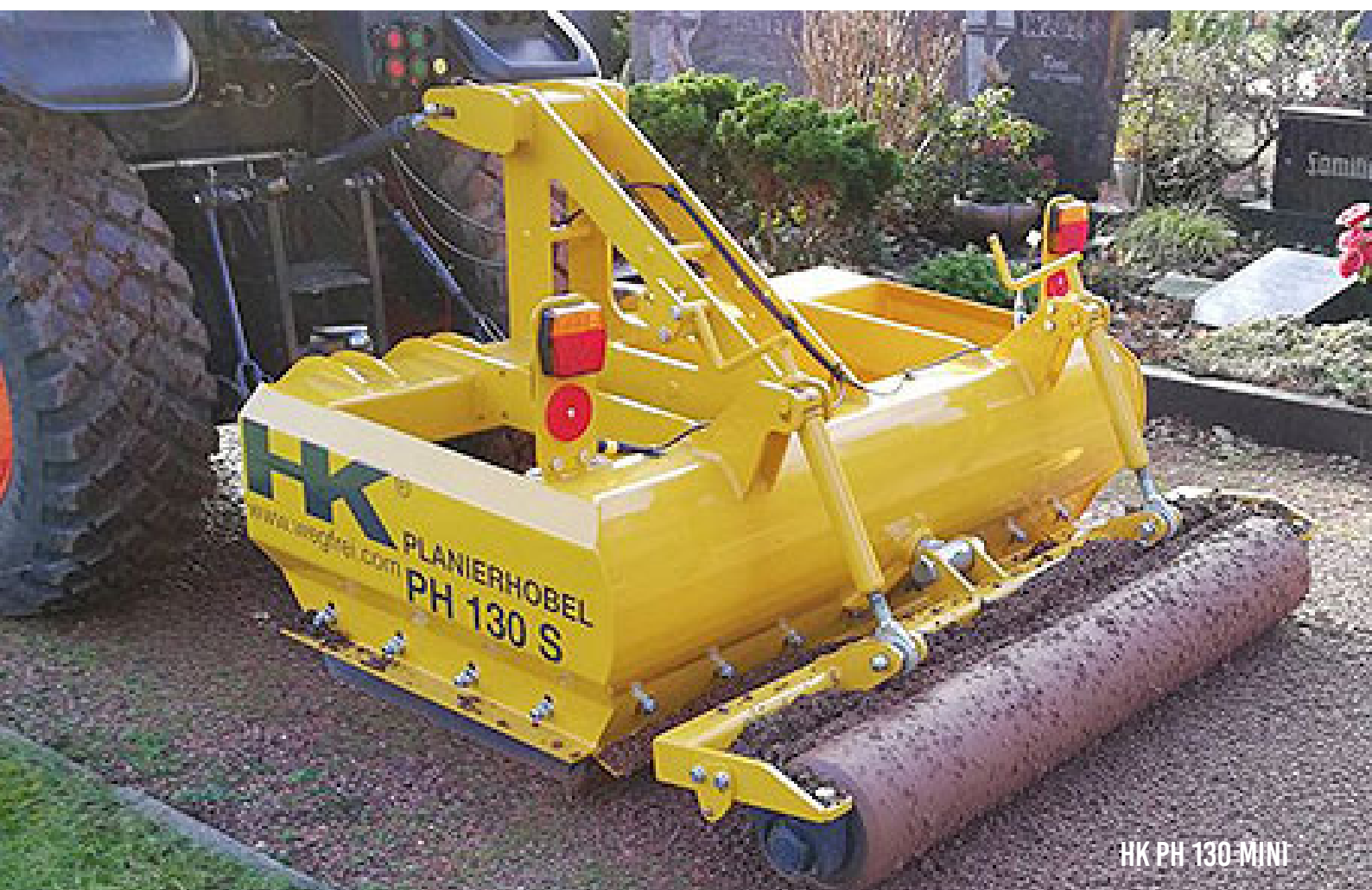
HK PH 130-MINI